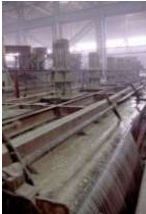
(a) Skimming of potassium minerals