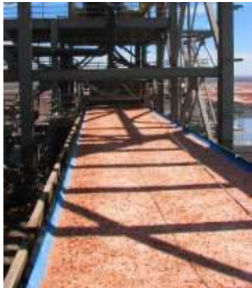
(b) Potassium chloride crystallization