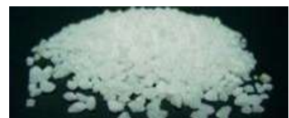
(e) Urea and potassium chloride