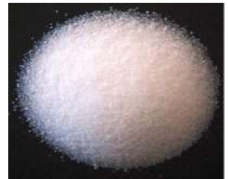
(b) Soluble grade