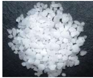
(c) Iron oxide coloration in KCl