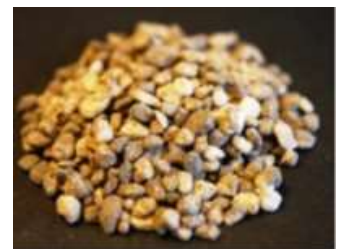
(d) Potassium sulfate