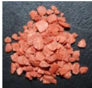
(c) Iron oxide coloration in KCl